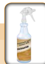
Table Top Sanitizer - RTU

order no: C00177 12 / 1 qt C00179 4 / 1 gal